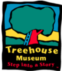
Tree House Children's Museum