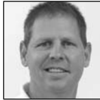
Danny Ainge Executive Director, Boston Celtics Boston, MA